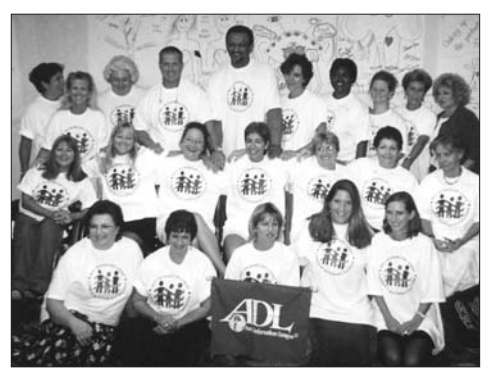
A few of the thousands who completed the ADL Peer Training Program and are now prepared to help fellow students take action against prejudice and bigotry.

The A WORLD OF DIFFERENCE® Institute Peer Training Program was developed as a means to address the community relations problems that arose from the 1991 riots in the Crown Heights section of Brooklyn, New