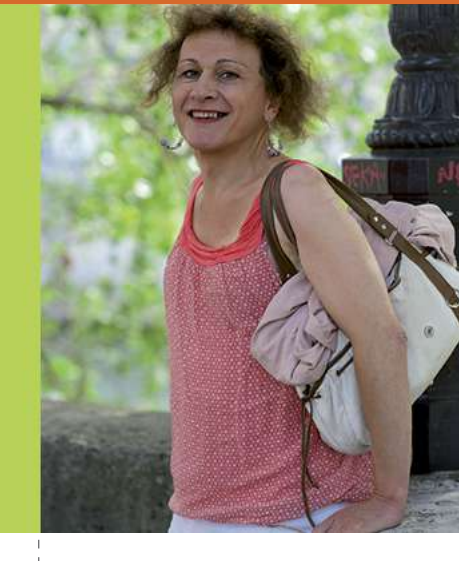
A short guide to legal gender recognition