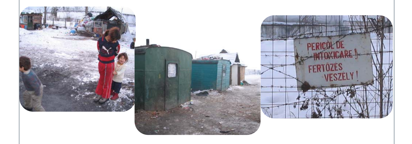
CRISS vs. City Hall Miercurea Ciuc - Harghita County

The cases documented as part of TRAILER are included in Romani CRISS's human rights annual report 2006, and in their human rights database - both available on their website www.romanicriss.org. The cases are also documented in a database on European Dialogue's website www.europeandialogue.org