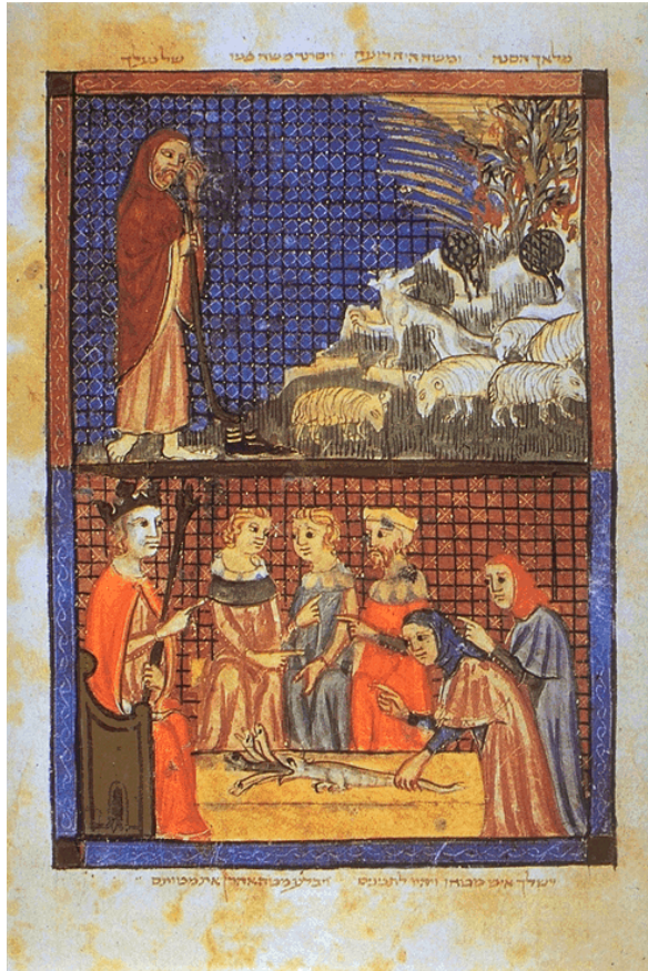
The Sarajevo Haggadah. - Zemaljski Museum, Sarajevo, Bosnia and Hercegovina