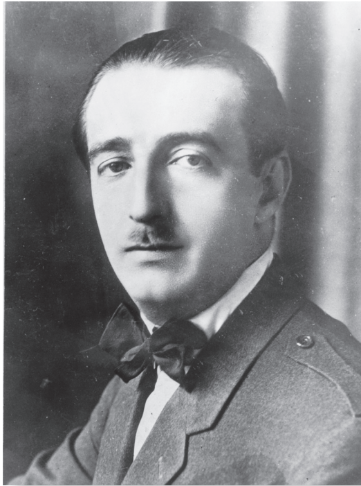
King Ahmed Zog (1895-1961), the ruler of Albania from 1925 to 1939. Prior to the Italian invasion, Zog issued Albanian passports to Jews fleeing persecution.

Jewish refugees began to travel to Albania during the 1930s as a result of Nazi persecution in Austria and Germany. The Albanian government assisted many Jewish refugees by providing Albanian visas and passports to some of those in need.