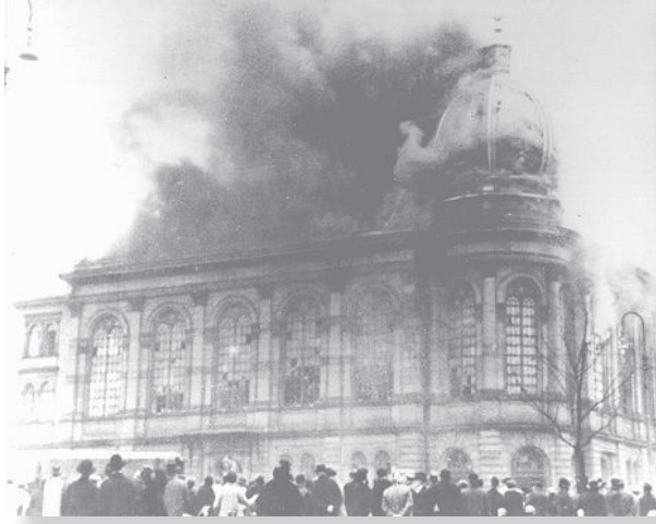
The Boerneplatz synagogue in flames during Kristallnacht , Frankfurt am Main, Germany, November 10, 1938.

Antisemitism means prejudice against or hatred of Jews . The term became widespread in the 1870s, but Christian antisemitism - intolerance for the Jewish religion - had existed in Europe for many centuries. Riots against Jewish populations were often sparked by false rumours that Jews used the blood of Christian children for religious rituals. At times, Jews were also blamed for everything from economic conditions to epidemics to natural disasters.