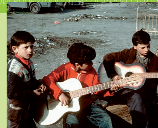
Publication: Roma on the Screen

The Council of Europe has developed a preschool teaching kit, an education programme designed to prepare children for entry into school, (as many Roma, Sinti, Traveller children do not attend nursery school for different reasons). The teaching kit helps facilitate an intellectual, emotional and social development within Roma communities by building up an educational tool for children between the ages of 5 and 7. This educational aid helps children develop the basic skills needed to start primary school, learn how to study, educate parents about the necessity of knowledge, improve children's analytical and reasoning skills, and encourage their imagination. The teaching kit is available as a CD-Rom with fact sheets for the individual activities and a methodological handbook for the tutor and/or mediator.