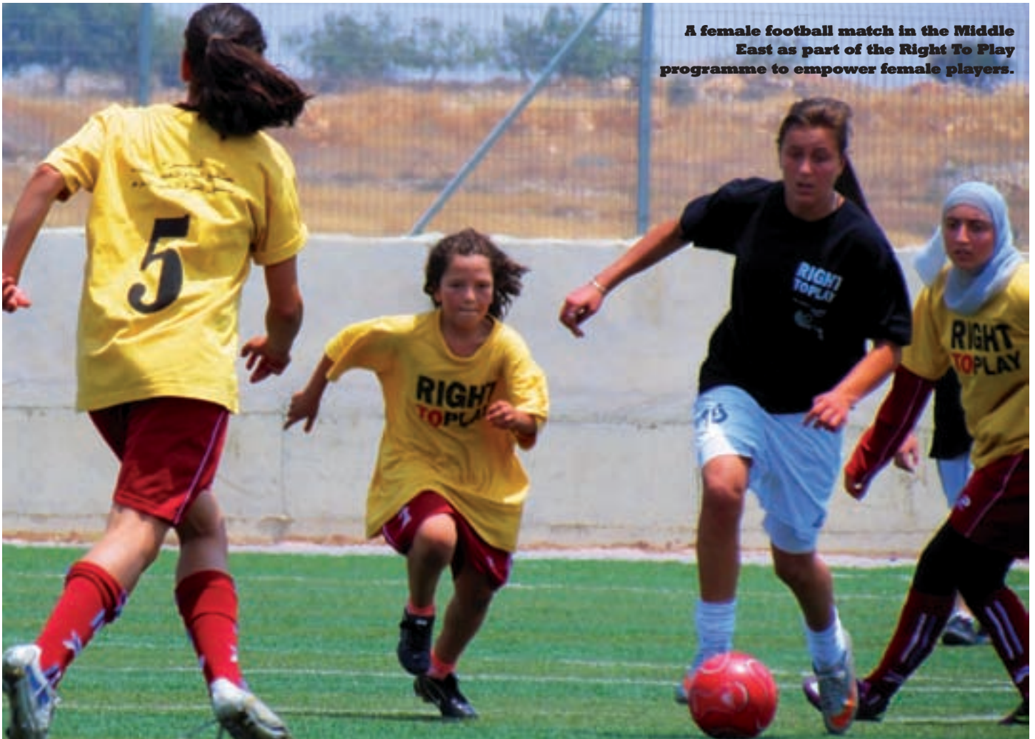
A female football match in the Middle East as part of the Right To Play programme to empower female players.

Street Soccer values participation over football skills and competition, engaging people who in many cases have given up on counselling and traditional support systems and services. It puts the person at the centre of the solution and provides them with the support and tools necessary to help themselves make positive changes.