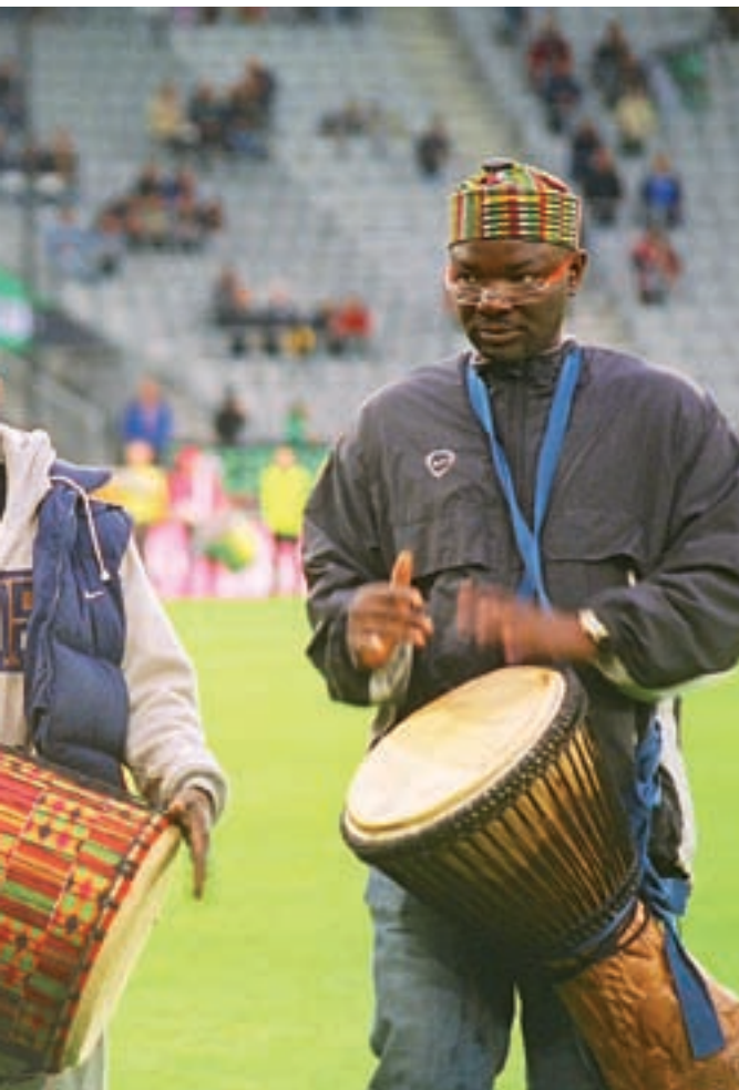
A cultural display before the campaign of the action - KICK POVERTY OUT - with FC Wacker Innsbruck and FairPlay-vidc.

pants SC organises regular health check-ups by a general physician and a paediatrician. Psychological counselling is regularly done by a professional to assess the situation, observation of instructional response and evaluate behavioural changes. Nutrition talks present simplified facts of health and hygiene in the form of a programme that makes it easy for the beneficiaries to make good choices when it comes to feeding their family. Through books, documentaries, photography and films, SC educates children on topics like wildlife, forests, water conservation, sanitation and recycling so that they become environmentally responsible. SC has also established cooperation with organisations like the Sunshine foundation (Sunshine Kids) aimed at the "prevention of potential second generation trafficking". A technical exchange has also been taking place with 'Dream a dream' to the mutual benefit of all