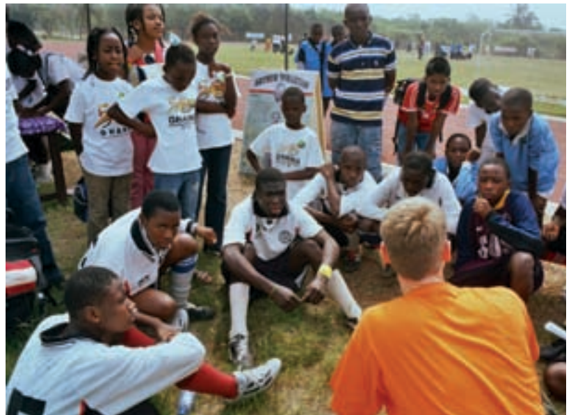
Aids prevention workshop through football.