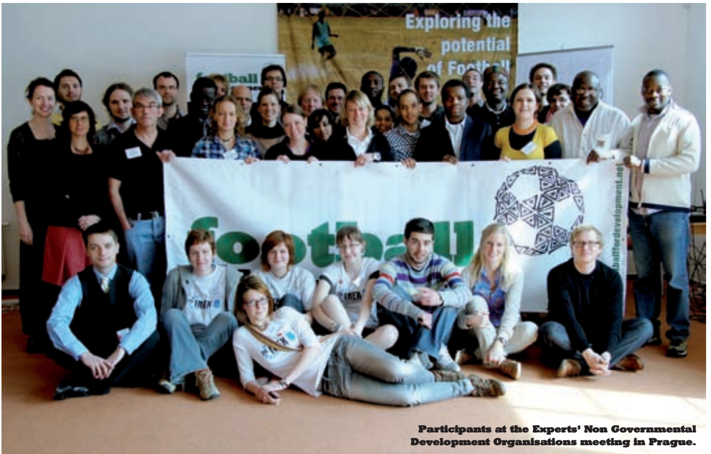
Participants at the Experts' Non Governmental Development Organisations meeting in Prague.