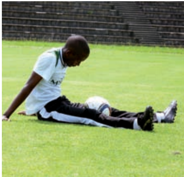
Bottom: Penalty shoot out at the Mondiali Antirazzisti in Italy.