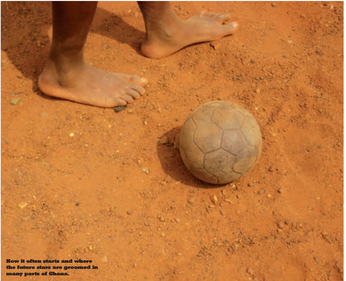
How it often starts and where the future stars are groomed in many parts of Ghana.

Coaches Across Continents (CaC) was officially launched after years of research in developing communities around the world. A curriculum was created to address a myriad of social needs through sports. This curriculum uses specific soccer drills, but incorporates social messages, fun and learning into a routine training. CaC volunteers work with teachers, coaches and community volunteers to enhance their existing local soccer programmes. This collaborative training takes place over a three-year period in ten day sessions per year and is called the 'Hat Trick Initiative.' The curriculum focuses on four areas: Soccer for Conflict Resolution, Soccer For Female Empowerment, Soccer for Health and Wellness (including HIV/AIDS) and Soccer for Fun. These specialisations are tied into the overall curriculum theme of ' From Chance to Choice ' – A dynamic curriculum