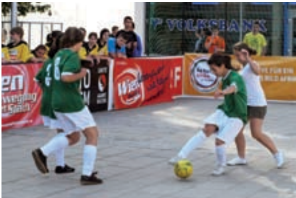
Girls soccer tournament in Vienna at Ke Nako days in Ottakring.