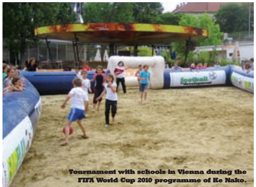
Tournament with schools in Vienna during the FIFA World Cup 2010 programme of Ke Nako.