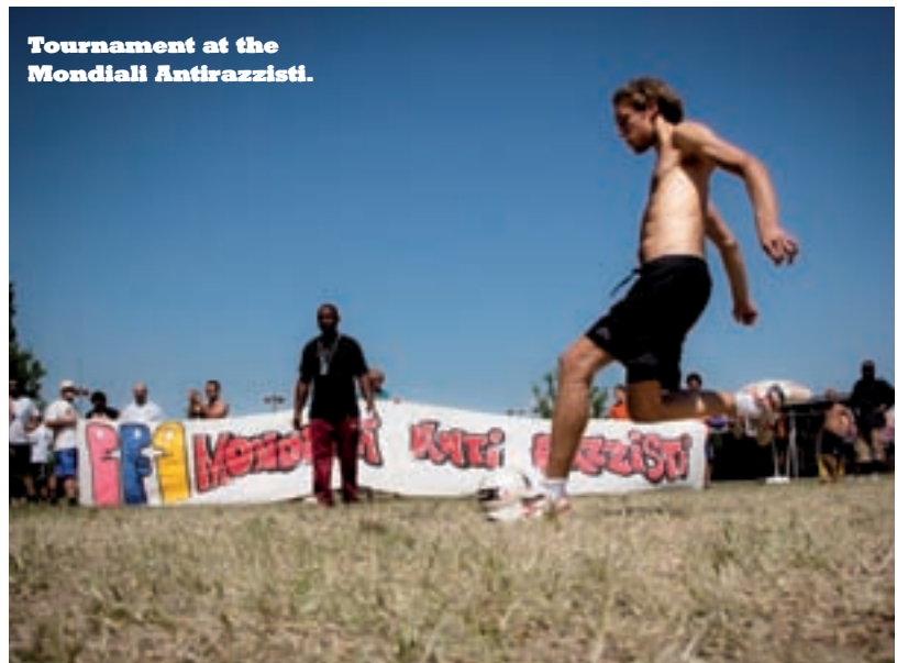
Tournament at the Mondiali Antirazzisti.