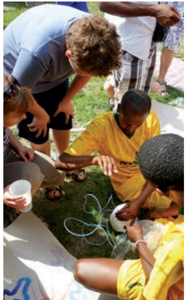
MYSA youth teaching their European counterparts how to create balls out of recycled materials.