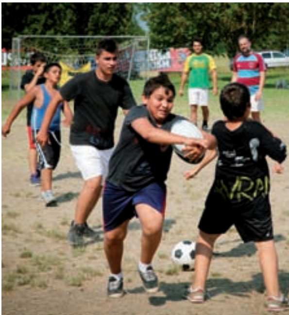
A lot of action on the field at the annual Mondiali Antirazzisti in Itlay where people, young and old meet to have fun, play football and take part in workshops, meetings and discussions on anti-racism and anti-discrimination work in football.