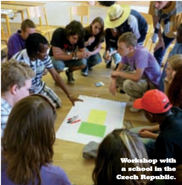
Workshop with a school in the Czech Republic.