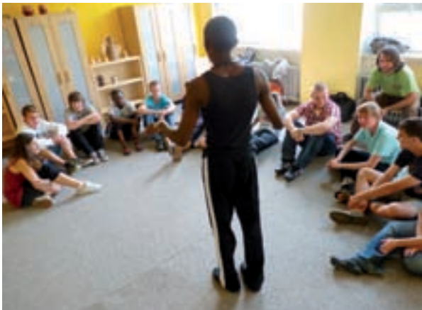
Workshops with school kids in Czech Republic.

ment of the local people to increase the sense of ownership and credibility of sports programmes and also a desire to ensure longer-term sustainability" (Coalter, 2009). A crucial consideration related to this is the human resources involved in the programme and the maximising of local people working within the organisation. As well as minimising the involvement of Western people, the reliance on Western funding must also be curtailed. The stability of donor funding is always an issue that can fluctuate depending on the economy or other unforeseeable conditions. This dependency and subsequent cessation of projects after loss of funding is all too common and could be combated with proper planning and sustainability measures put in place.