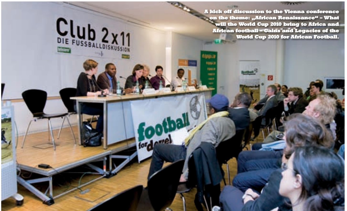
A kick off discussion to the Vienna conference on the theme: „African Renaissance“ - What will the World Cup 2010 bring to Africa and African football - Gains and Legacies of the World Cup 2010 for African Football.