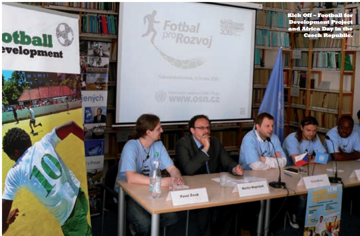
Kick Off - Football for Development Project and Africa Day in the Czech Republic.