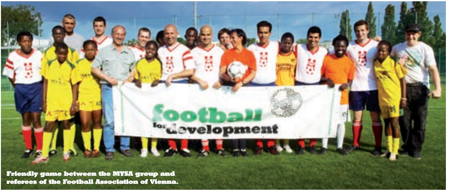
Friendly game between the MYSA group and referees of the Football Association of Vienna.

Streetfootballworld and FIFA have had a strategic alliance since 2007. Together they have developed Football for Hope, a major component of FIFA's corporate citizenship activities. Football for Hope is a multifaceted initiative that includes the development of 20 community centres for health, education and football across Africa; milestone events on Development through Football during the FIFA Confederations Cups and the FIFA World Cups; a scheme for on-going financial support to local organisations; and several other programmes. This alliance coordinates programmes and projects within the realms of football for development in all continents. The alliance is based on a common understanding of football as an effective tool for positive social change worldwide and a shared desire to leverage the potential of associated football and the global mega events in football.