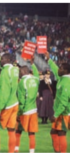
Left: Members of the national team of Côte d'Ivoire in a Show racism the red card campaign just before the kick off at the friendly against the Austrian national team.