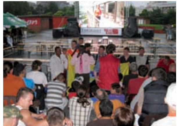
Workshop in Hungary of Football for Development partner Mahatma Gandhi Human Rights Organisation (MGHRO).

Since the most recent version of the website was launched in 2008, more than 3,000 articles have been published on the site. This means close to three articles per day! In the lead up to, during and post the FIFA World Cup 2010, sportanddev.org published 70 articles, specifically related to the developmental aspects of the FIFA World Cup 2010. Since 2010, sportanddev.org has provided coverage and exposure to a range of other football events, including the FIFA Women’s