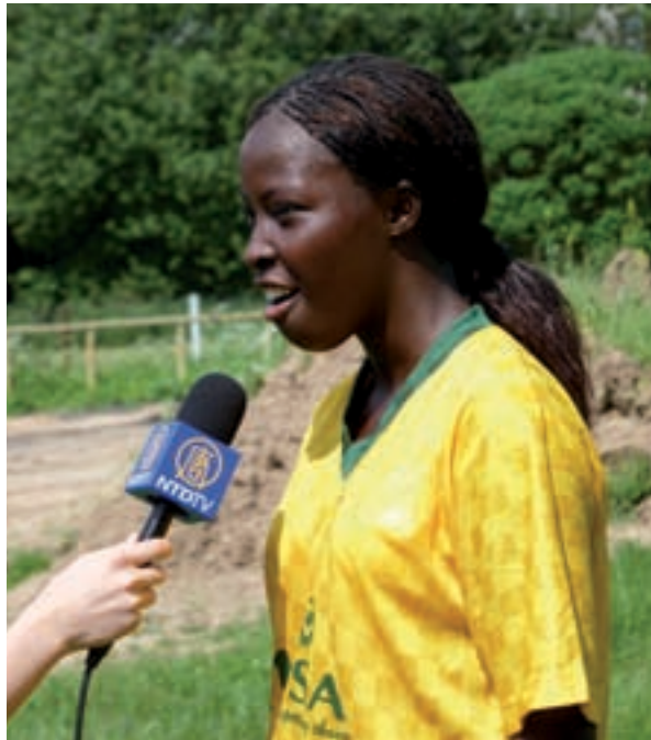
Bottom: Anthony Baffoe in a chat and interview with youths and children at the 2008 Football for Peace and Social Development co hosted by SOS Childrens Villages Ghana in the run up to the 2008 African Cup of Nations in Ghana.