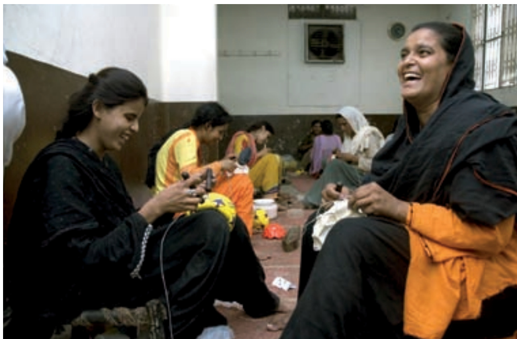
Top: The photo shows a Fair Trade Women's group in Pakistan sewing footballs under Fair Trade terms.

*FAIRTRADE standards guarantee fair payment for workers, independent from the usual prices on the world market. In addition to the higher prices, an extra bonus for social projects is paid out. The whole process of fair traded products and production is certified by the independent FAIRTRADE labelling organisation with its unique label.