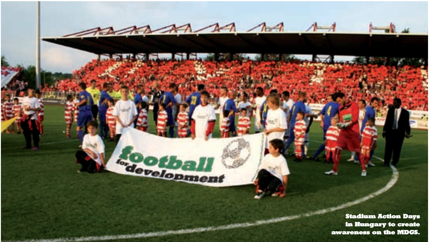
Stadium Action Days in Hungary to create awareness on the MDGs.