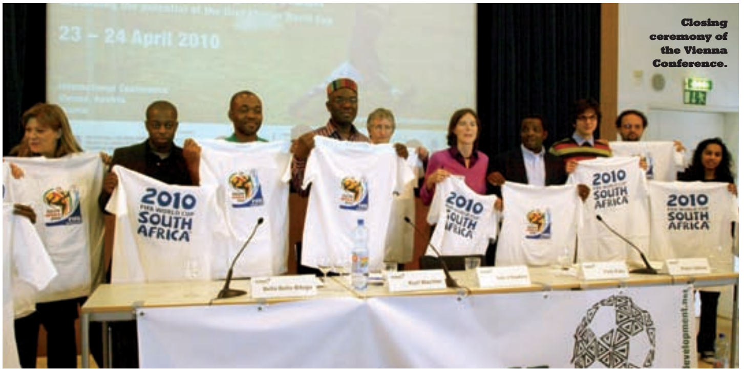
Closing ceremony of the Vienna Conference.