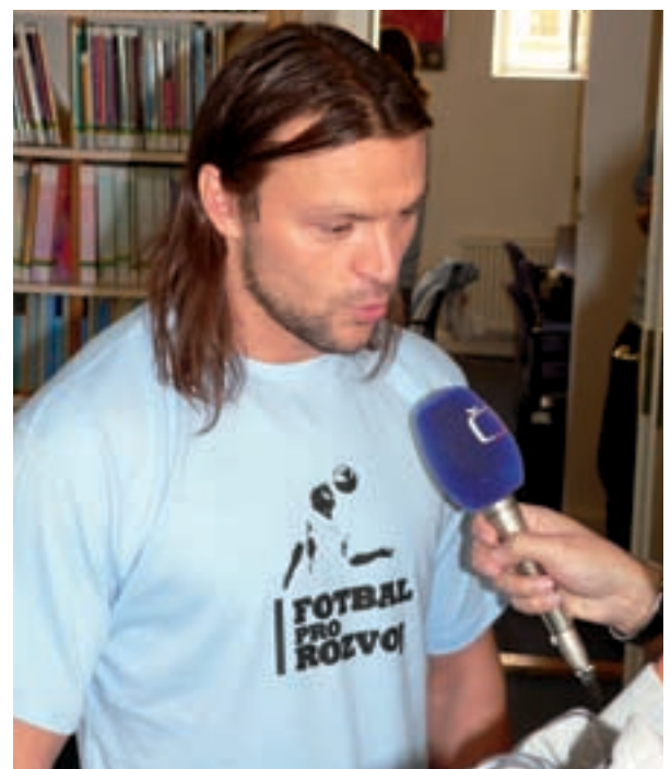
INEX-SDA ambassador Tomáš Ujfaluši at the press conference in Prague, June 4 th 2010, held in the Information Centre of the United Nations to present the kick-off of the MYSA tour in the Czech Republic.

Recommendation: Sport’s positive role in development remains under-reported and under-represented in mainstream media. Stories discussing sport’s role in development are often deemed successful, and for those that are not, open, transparent discussion of their failures is needed. As such, sportanddev.org for example, provides the platform on which such stories can be showcased and on which discussion takes place. The media should not only cover stories from mainstream sports events but also those events and initiatives that are often ‘hidden’ or undiscovered, namely community events and projects that take place in developing countries and communities. The media should direct efforts to meet the need for coverage of football-for-development initiatives, projects and events as well as the organisations and individuals that run them.