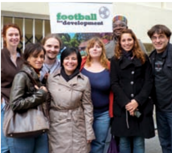
Members of the Football for Development project.

organisations committed to use football as a means of fostering development, eradicating poverty and raising awareness on the environment and global inequity and encourage South-South cooperation.