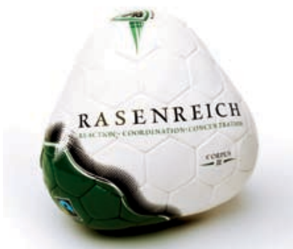
Bottom: An international football tournament based on fair play principle.