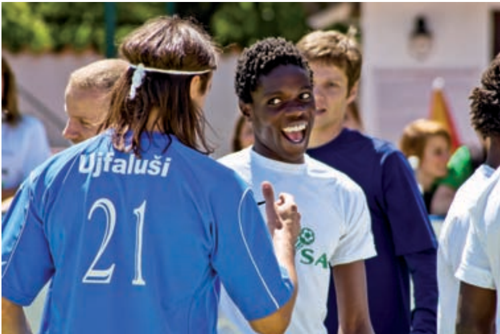
Top: Tomáš Ujfaluši former captain of the Czech national team in a chat at a demonstration match with the players of Mathare Youth Sport Association (MYSA) during their European exchange tour.