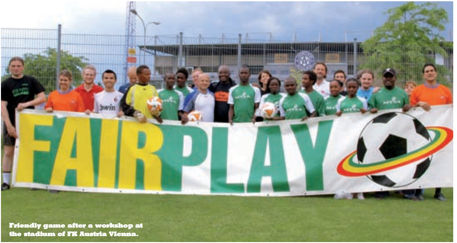
Friendly game after a workshop at the stadium of FK Austria Vienna.