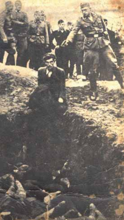
Vinnitza, Ukraine, German soldiers watching an Einsatzgruppen soldier murder a Jew, July 1941

in attacking and almost destroying the Jewish population, not only of Germany but of most of Europe, will raise awareness about the roles and responsibilities of the State, of individuals and of society as a whole in the face of increasing human rights violations. An examination of the actions of German doctors and nurses in the so-called “Operation T4” euthanasia program of Nazi Germany (which led to the killing of more than 200,000 mentally or physically disabled men, women, and children over six years) is another example. Likewise, the participation of regular German soldiers in the killing of over one million Jews as part of the work of the Einsatzgruppen (special killing squads) in the eastern parts of Europe, leads to questioning human behaviour, conformism and the power of ideologies; in short, the adhesion of a society to a government undertaking actions that violate internationally recognized human rights. Educating about the Holocaust can help young people to understand key concepts that will be useful when studying other examples of mass violence. When pupils explore the history of other massive human rights violations, they will be able to draw on their understanding of the Holocaust and become more aware of their own responsibilities as global citizens.