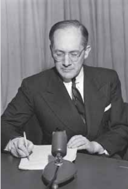
Dr Raphael Lemkin, who coined the word "Genocide"

Regardless of geographical location, all human cultures, over the course of time, have engaged in the killing of other humans. As the power of weapons of destruction has grown, so have the number of people killed by other human beings. Alongside the genocide of European Jewry, Nazi Germany also carried out a genocide of the Roma (a crime sometimes called the Porajmos, "Great Devouring", or Samudaripen, "Great Dying"), a mass murder of the Poles, and a mass killing programme of the disabled. They committed mass murder of more than three million Soviet prisoners of war, killed countless civilians in occupied territories, and murdered tens of thousands more through persecution of political opponents, homosexuals and Jehovah's Witnesses. So traumatic was this assault on human values, a new word was coined during World War II by a Polish-Jewish lawyer, Raphael Lemkin, to describe it: genocide.