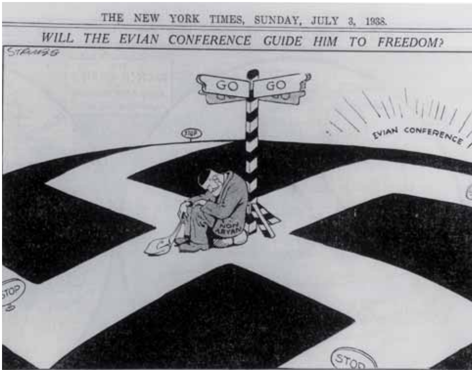
A British cartoon reflecting the hopes that are placed in the Evian Conference—This meeting, to be at Evian, France, on Wednesday to arrange for the emigration of political refugees, was called at the instigation of the President and Secretary Hull, and only Italy, out of thirty-three nations asked to join, refused to participate. Myron C. Taylor, industrialist, will represent the United States.