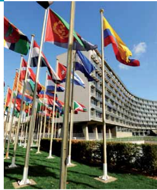
UNESCO Headquarters in Paris

UNESCO's mission is to contribute to the building of peace, the eradication of poverty, sustainable development and intercultural dialogue through education, the sciences, culture, communication and information. UNESCO believes that it is essential to learn about the Holocaust to better understand the causes of Europe's descent into genocide; the subsequent development of international law and institutions designed to prevent and punish genocide; and that the careful comparison with other examples of mass violence may contribute to the prevention of future genocides and mass atrocities.