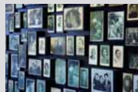
Exhibition of family portraits at Auschwitz-Birkenau State Museum

process. It facilitates the understanding of specificities and differences between events of mass violence. However, while it is educationally valuable to conduct a comparative study of genocides, it is critically important not to attempt a comparison of suffering. Educators should concentrate on the various destructive policies carried out by Nazi Germany and its collaborators when undertaking a study of the Holocaust. When examining other genocides,