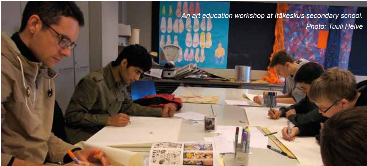
An art education workshop at Itäkeskus secondary school.