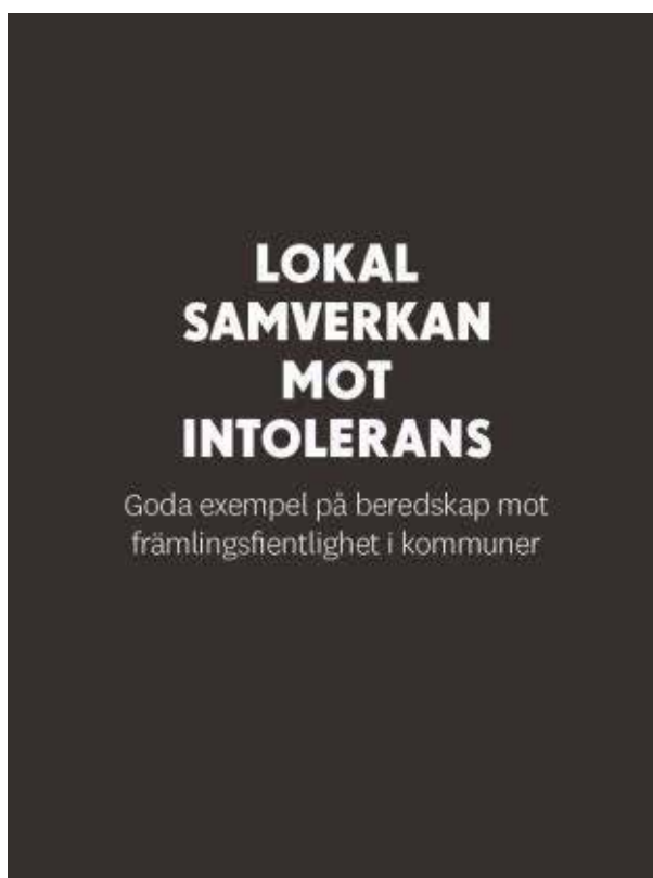
Local cooperation against intolerance – good examples of municipalities' preparedness to act against xenophobia"

The anti-racist material was produced in the form of an easily accessible leaflet in Swedish and was translated into Finnish. Work carried out to prevent xenophobia in five Swedish municipalities was described. The focus lies on municipalities in which cooperation between civil society and local government has been successful. The starting point for the material was that cooperation forms a foundation for knowledge and experience of various kinds that will strengthen methods of responding to xenophobic acts.