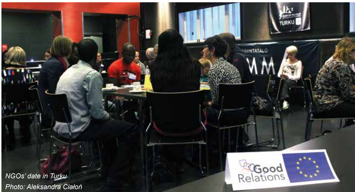
NGOs' date in Turku