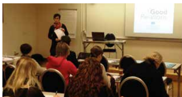
Awareness-raising session in Jokkmokk

In Jokkmokk, 48 persons from nine different municipalities, NGOs and government agencies participated in the session. In Borlänge there were 47 participants. The high turnout can be attributed to the peer factor; local authorities trust each other and the sessions therefore seemed relevant and well-targeted for the participants.