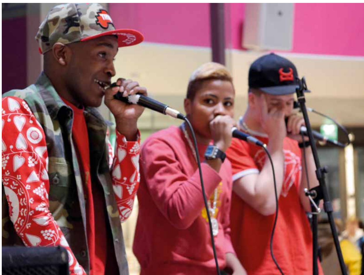
Hip hop artist NokLand performing at the Faces of Tampere event

Weekend of Cultures was a three-day event organised in the suburb of Kontula in Helsinki. The programme included a variety of activities such as a puppet show and cooking courses, an oriental dance class and a regional discussion forum on multicultural Finland, including a panel discussion featuring representatives of civil society organisations, researchers and local councillors. Two music club events were also organised, one of which was targeted at young people in particular.