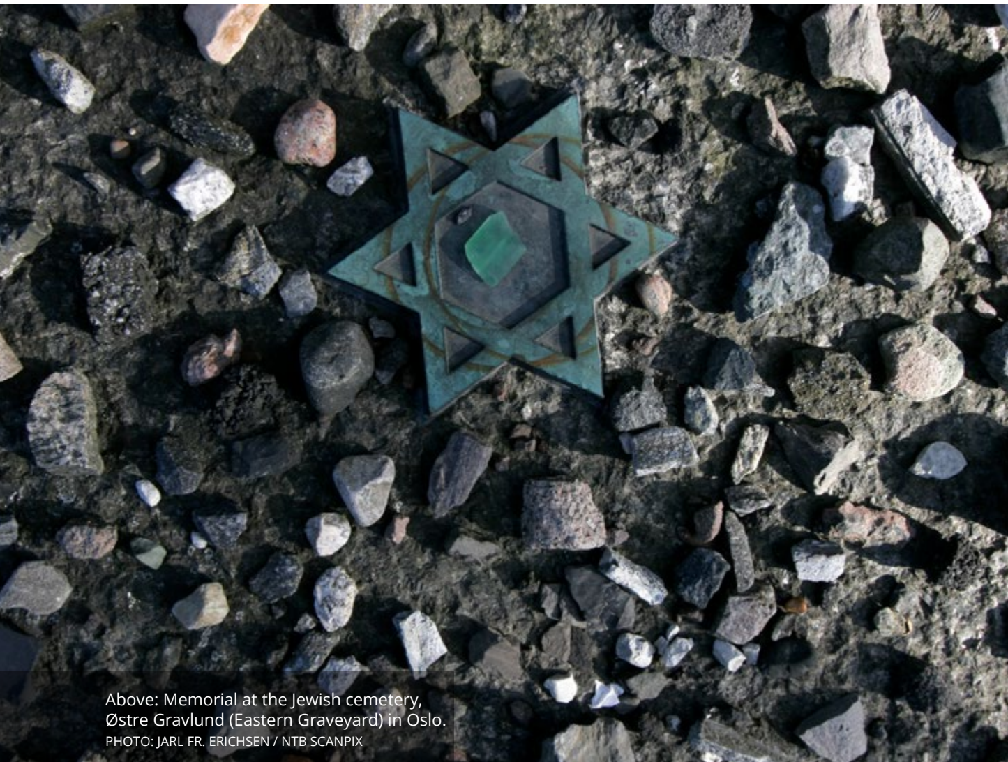
Above: Memorial at the Jewish cemetery, Østre Gravlund (Eastern Graveyard) in Oslo.