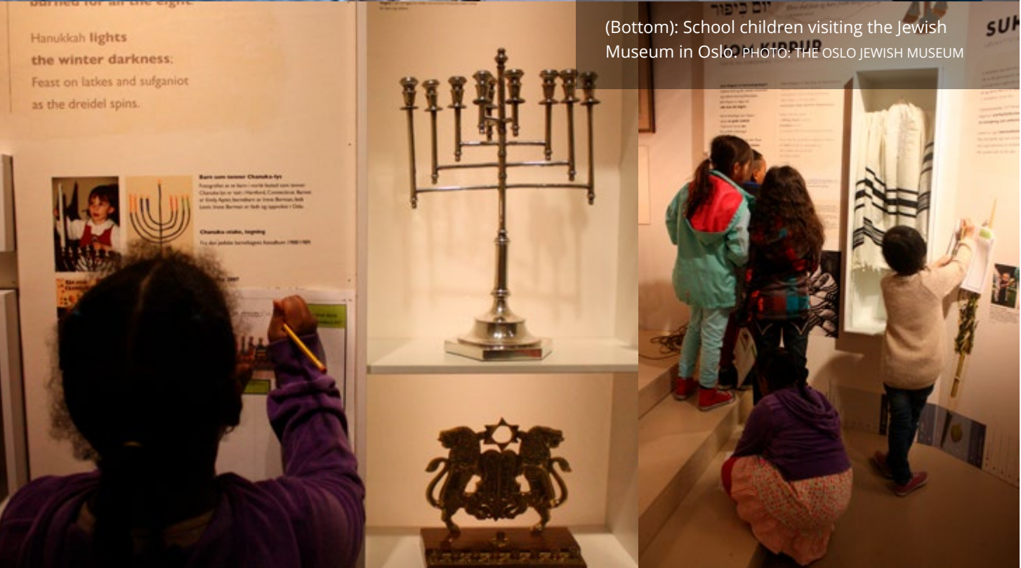
(Bottom): School children visiting the Jewish Museum in Oslo.