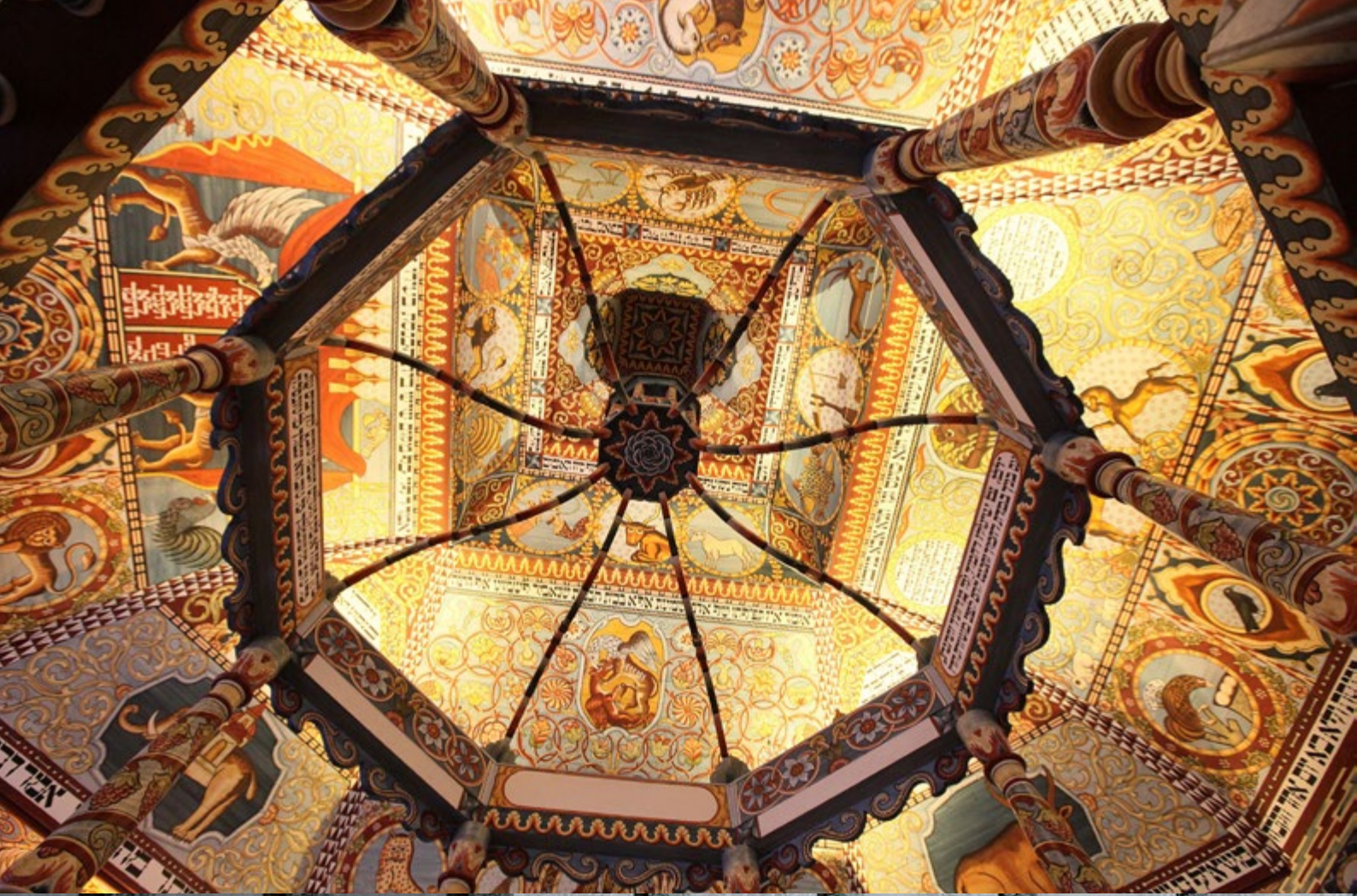
Images from the POLIN Museum of the History of Polish Jews in Warsaw, Poland.