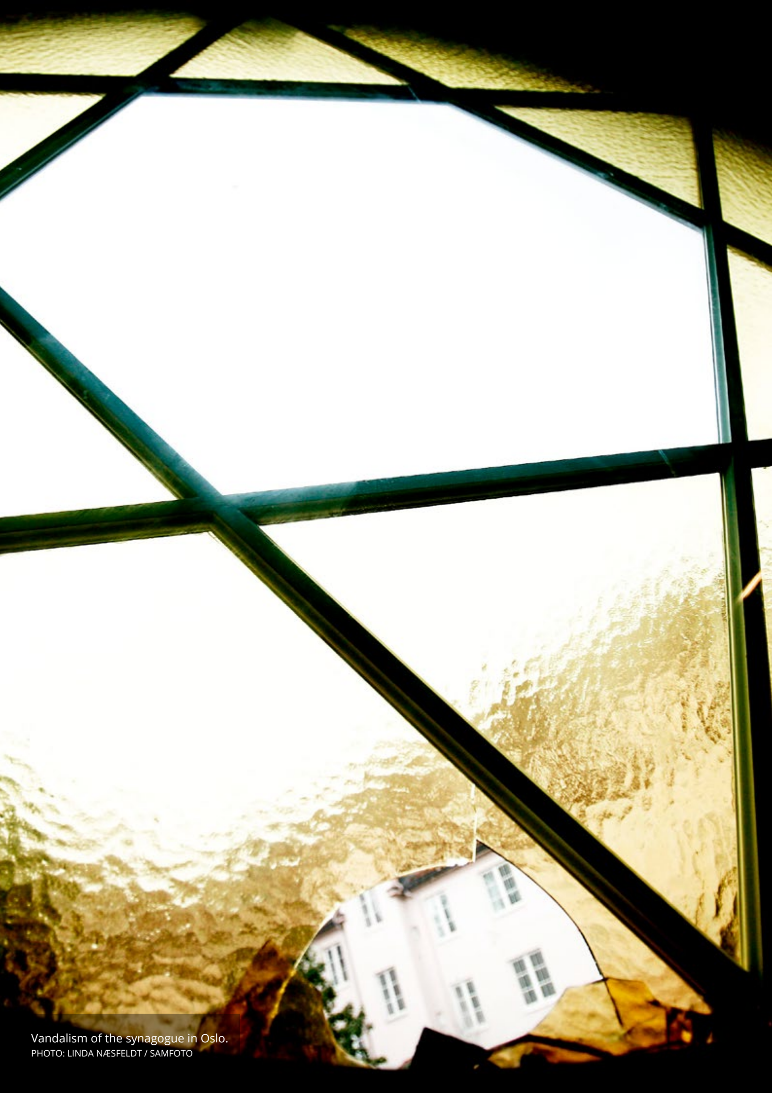
Vandalism of the synagogue in Oslo.