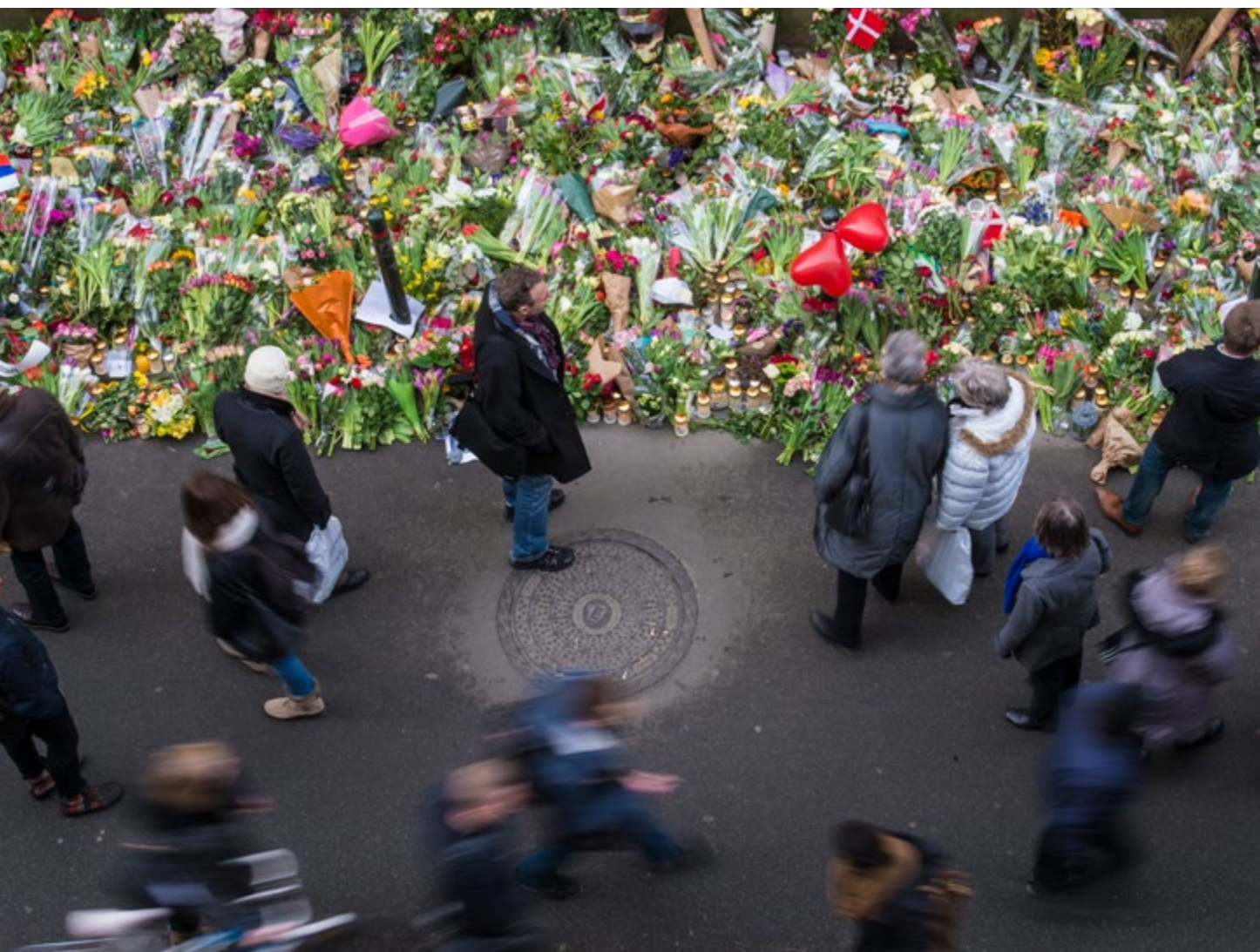
Top: Outside the synagogue in Copenhagen after a Jewish guard was shot and killed in February 2015.