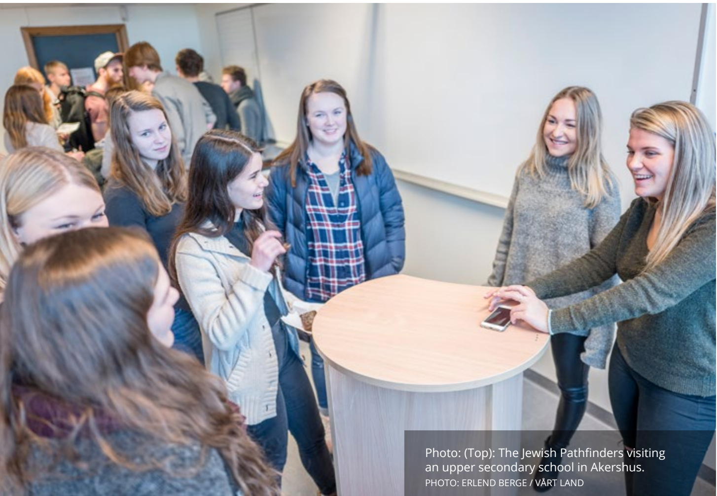
Photo: (Top): The Jewish Pathfinders visiting an upper secondary school in Akershus.